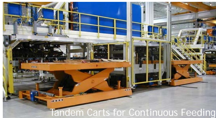
Tandem Carts for Continuous Feeding