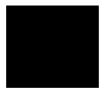
Handling Specialty Low-Gloss Black HS-QT110BK259 RAL 9004