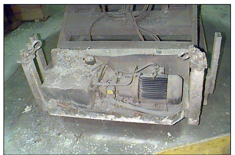
Figure 6 An example of an HPU whose cover was accidentally damaged during usage allowing mortar to accumulate inside. Had the HPU not been covered, the power unit may have required replacement instead of just a thorough cleaning.

It is recommended that the hydraulic power unit (HPU) at the base of the lift be covered by a sturdy metal enclosure to prevent damage from regular usage and the accumulation of mortar (please see Figure 6). The better protected the HPU is, the longer it will run without requiring repair.