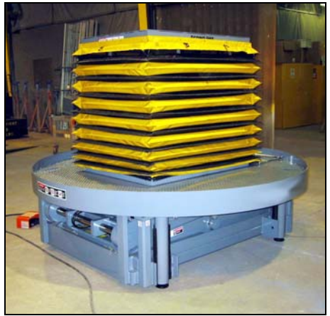
Figure 2 Example of collapsed ladle lift with secondary lift in raised position on top