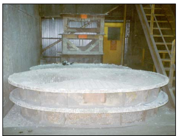
Figure 1 Photo of stacks of stationary "pies" in foreground and stationary brick pallet tables in background

Stationary work platforms are placed by crane within the ladle one atop another throughout the rebricking process to periodically raise the level of the refractory mason(s). These stackable platforms are also commonly referred to as scaffolding or pies. Time must be spent removing all materials and allowing personnel to exit via ladder each time an additional platform is added to the stack.