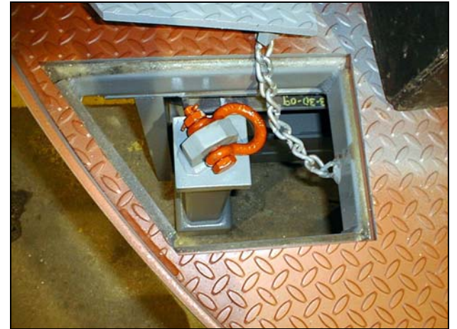
Figure \overline{5} One of four lifting shackles accessible through the lift platform.

Like the leveling devices, lifting shackles should be attached to the base of the lift to ensure maximum stability and safe load handling via overhead device. These lifting shackles should also be accessible through the top platform of the lift when the lift is in the fully collapsed position. Ideally, such access should be via removable access covers on the lift platform to avoid creating trip hazards.