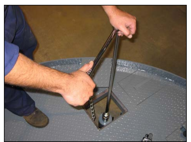
Figure 4 Example of a leveling leg being manually adjusted from the top of the lifting platform via a special access cover.

If leveling capability is requested of the lift manufacturer, leveling should occur at the base of the lift using a minimum of three but preferably four leveling devices. Four devices improve overall weight distribution and load handling stability. Furthermore, it is important that the leveling devices be accessible from the lift platform since leveling will occur once the collapsed lift has been placed within the ladle. Leveling devices will no longer be accessible from the side of the lift when this occurs.