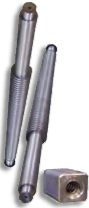
Screw & Nut